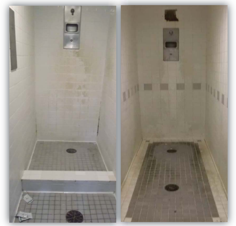
Figure 3. Moldy, mildewed shower stalls observed by OIG at TLF on November 16, 2016

In two modules housing detainees, common area showers were not clean. We found trash, mildew, and mold in the shower stalls. According to OCSD staff, detainees are required to clean their showers daily; however, detainees are only given a scrub brush and an all-purpose cleaner, which does not combat mold and mildew. Additionally, requiring detainees to clean common areas used by all detainees is in violation of ICE standards, as detainees are only required to clean their immediate living area.