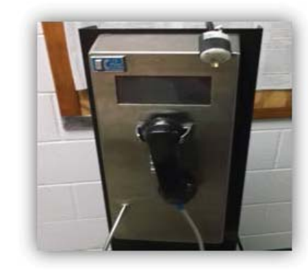
Figure 4. Broken plug on phone observed by OIG at TLF on November 16, 2016

An ICE Office of Professional Responsibility, Office of Detention Oversight report from a 2013 inspection of TLF identified telephone problems, including low volume and inoperable phones. In three modules we visited, the telephones were not operable. Detainees interviewed also confirmed that some phones did not work and