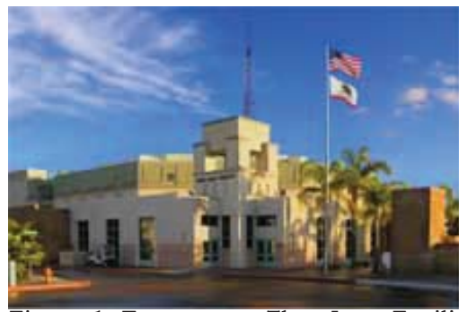
Figure 1. Entrance to Theo Lacy Facility

The Theo Lacy Facility (TLF), operated by the Orange County Sherriff's Department (OCSD), houses U.S. Immigration and Customs Enforcement (ICE) detainees through an Intergovernmental Service Agreement. TLF has the capacity to house 3,442 males, all with some degree of criminal history. Some detainees have been convicted of crimes, served their prison sentence, and have been transferred to TLF to await deportation by ICE or an